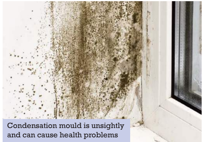
Condensation mould is unsightly and can cause health problems

Newly built homes can sometimes feel damp because the water used during construction (in cement, plaster etc) is still drying out.