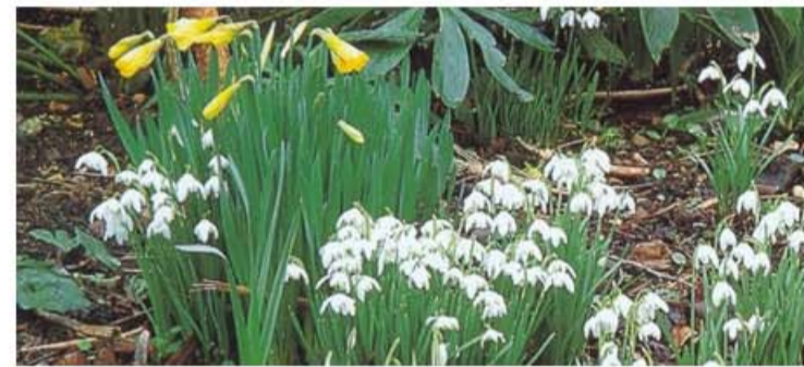
Daffodils and Snowdrops