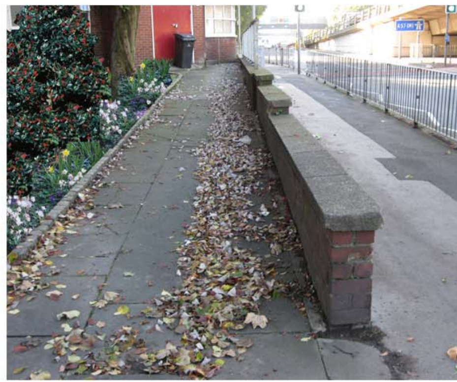
Screen Mancunian Way with partial screen created by planting holly under existing trees so that footway is not in shadow from lighting columns along footway.