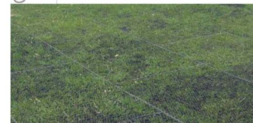
Grass mat safety surfacing beneath Multiuse Play Equipment