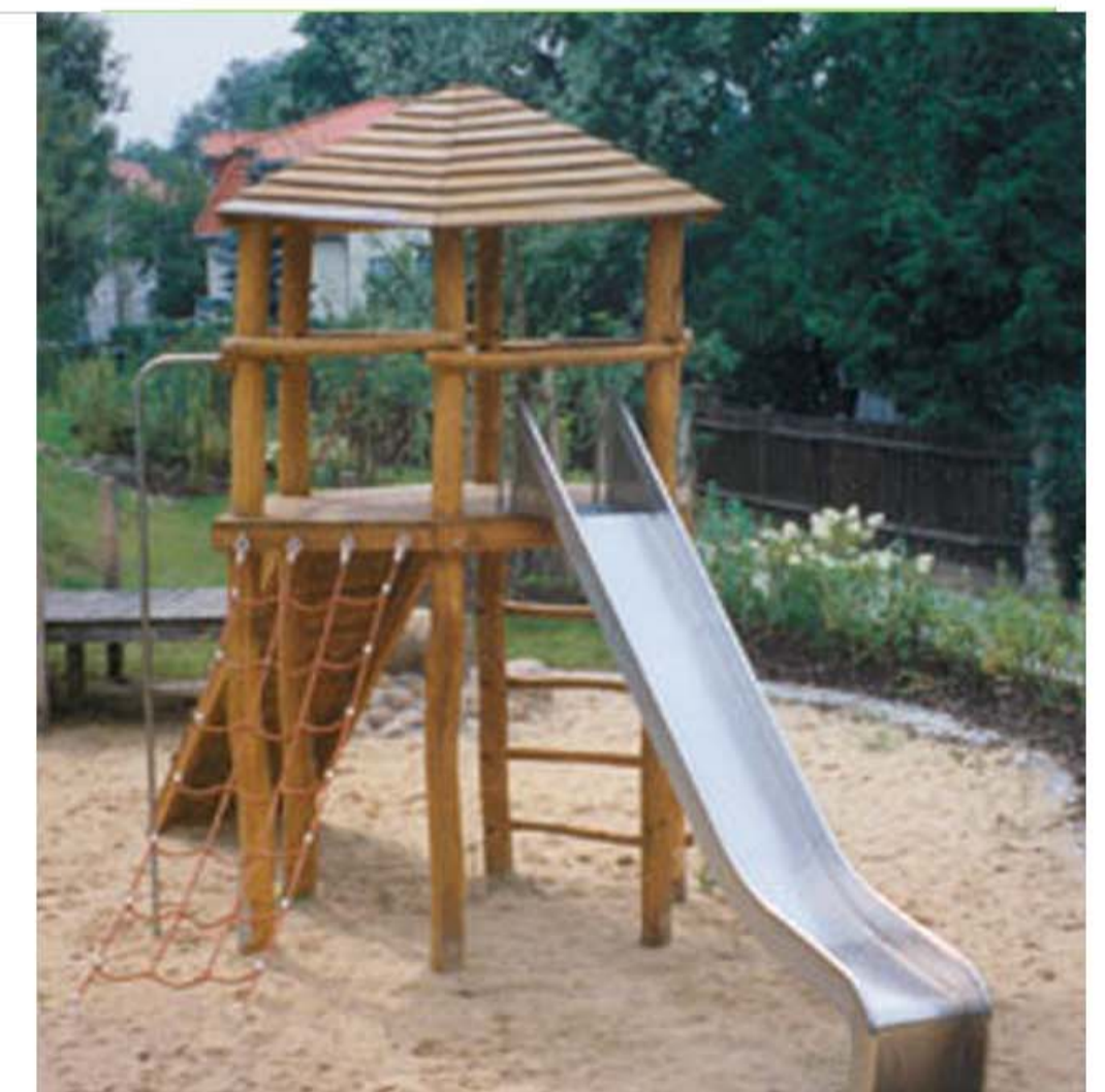
Children's Play Company Otford Multiuse Timber Play Equipment with steel slide