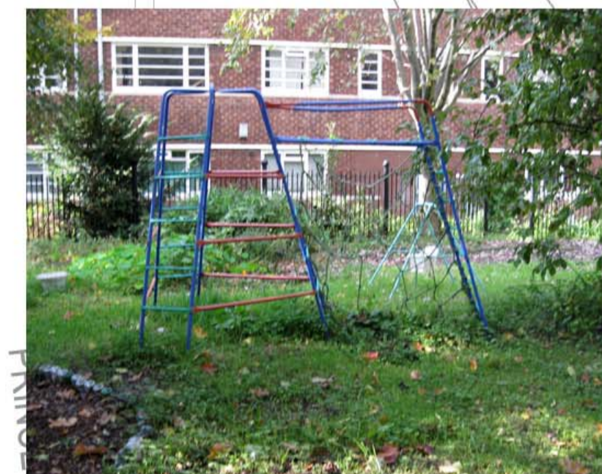
Delapidated play equipment to be removed