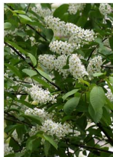
Bird Cherry for spring blossom