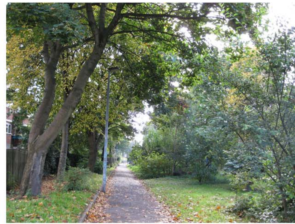
Proposed Play Area to be created by removing coppiced willow but retaining Medlar tree.