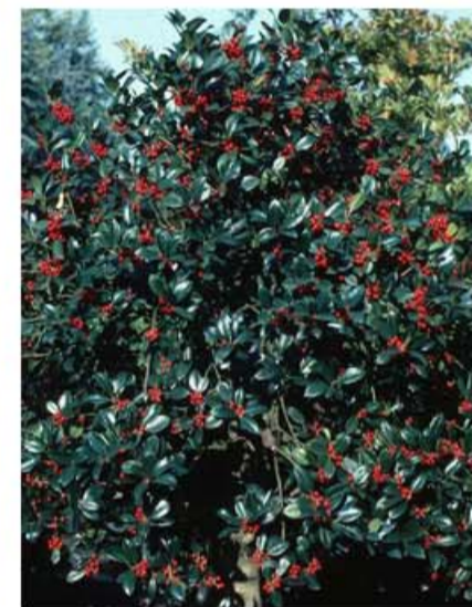
Holly to provide evergreen screen