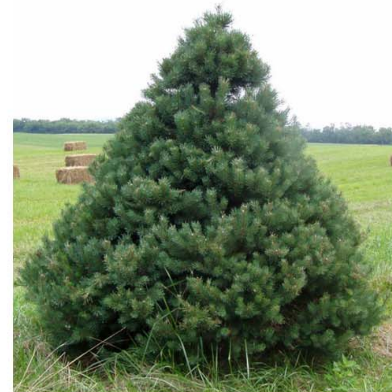
Scots Pine to provide evergreen screening