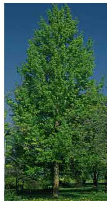
Aspen autumn colour