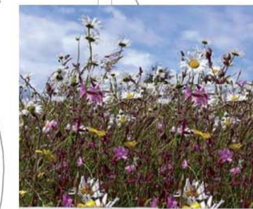
Wildflower mix has annuals Corncockle, Cornflower and Corn Chamomile, and perennials Meadow Buttercup, Ox-Eye Daisy, Bird's-foot-trefoil, Meadowsweet and Red Campion.